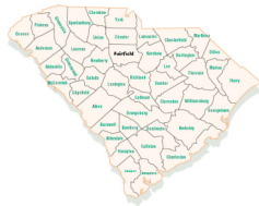
County Map of SC Open in new window