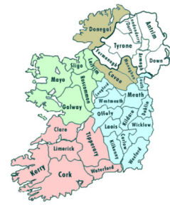
View old map of County Down in northeast Ireland