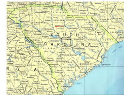
State of South Carolina Open in new window