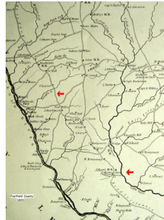
Fairfield County 1820 West Area Closeup of Land Along the Terrible Creek and the Holmes' Store Open in new window