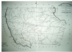
Fairfield County 1820 Map -- Open in new window - Or - Copy from Library of Congress Click, then click again on map